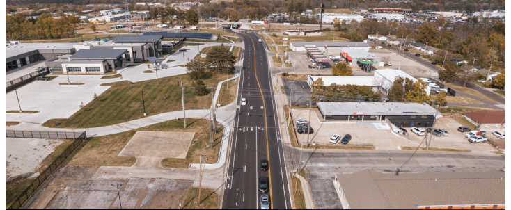
ROUTE 763, BOONE COUNTY

NAPA Quality in Construction Award: Capital Paving and Construction earned two national Quality in Construction awards from the National Asphalt Pavement Association for work on Route 763 in Boone County and I-44 in Crawford County.