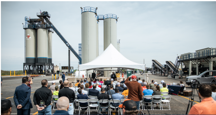
OZARK ASPHALT PLANT RIBBON CUTTING

We recently opened a new asphalt plant in Ozark, Missouri , a state-of-the-art facility built to meet the needs of a rapidly growing region. This plant will deliver high-quality materials, support infrastructure development, and open up excellent career opportunities. Its opening also enables the Ozark Quarry to modernize and grow in its current location, further strengthening our commitment to the Ozark area.