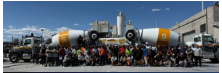
CEMEX & SIERRA READY MIX

In March, Farmer Companies acquired three Cemex Ready Mix Plants in the Las Vegas market. The strategic combination of Cemex and Sierra Ready Mix, previously purchased in December of 2023, not only strengthens our market presence in Las Vegas; but brings together two companies with a shared commitment to quality, safety and innovation. By joining forces, Sierra Ready Mix is poised to become the third-largest ready mix concrete supplier in the area dedicated to meeting the growing demands of the local construction market.