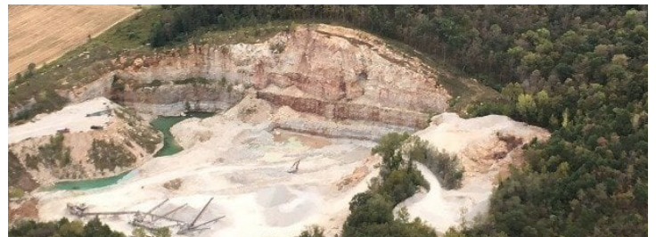
FEMME OSAGE QUARRY, AUGUSTA, MO

Capital Aggregates continues to grow with the recent acquisition of three strategic assets. These include a sand and gravel plant in Batesville , Arkansas, and the acquisition of Mertens Quarries, which consists of two rock quarries - Femme Osage in Augusta, Missouri, and a second location in Treloar , Missouri. We're excited to expand our aggregate production footprint to better serve our communities and customers.